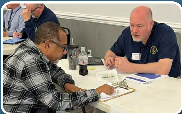
DEMA participated in a Family Assistance Center exercise on April 18 in Frankford that simulated a multi-agency response to a mass fatality incident designed to provide support to impacted families.