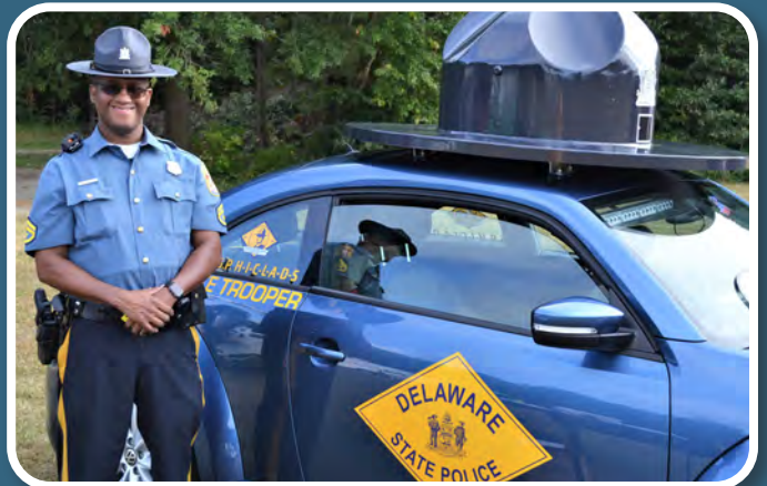
Delaware State Police brought its helicopter, marine unit, and community engagement team to FEP Day.