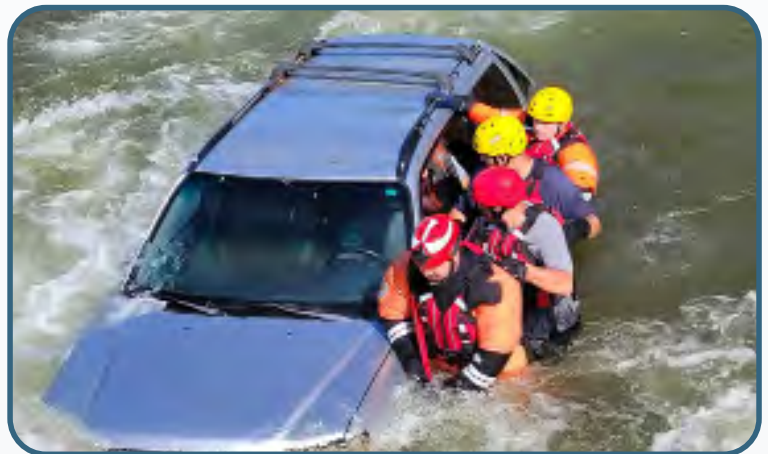
Delaware first responders attended this swift water rescue technician training by Atlantic Technical Rescue thanks to funding provided by DEMA.

DEMA provided $200,000 for swift water rescue boats and special training that helped support North Carolina hurricane victims.