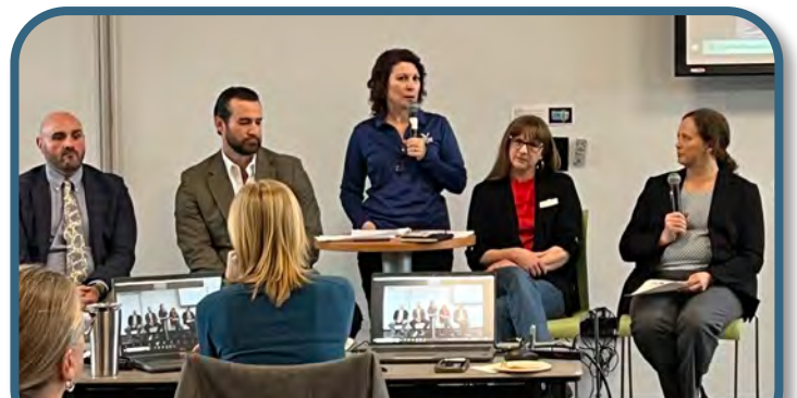
DEMA participated in the 2024 Flood Insurance Forum with Delaware Sea Grant in Lewes.