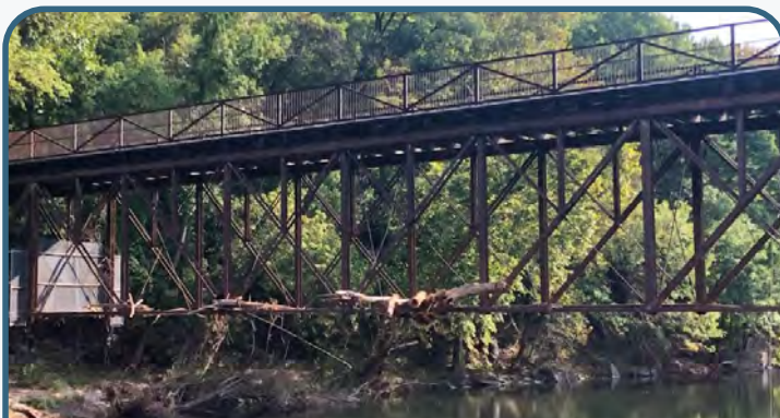
DEMA helped coordinate federal funding for the Bancroft Bridge Replacement Project in Wilmington.

Delaware was the first state in Region 3 to submit its 2025 Administrative Plan to FEMA. Staff worked with New Castle County and the FEMA Validate As You Go (VayGO) Team to confirm $5.73 million in costs under the COVID-19 disaster declaration. DEMA also worked with external partners to produce two new YouTube videos to inform potential Delaware applicants about how to apply for funding under the Public Assistance program. DEMA also coordinated with FEMA and DNREC to progress the review, obligation and startup of the major Bancroft Bridge Replacement that brought over $2.7 million to Delaware.