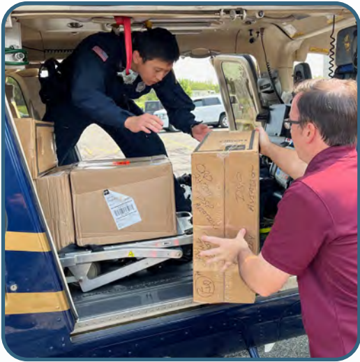
Delaware State Police's critical care helicopter picked up supplies at DEMA as part of the new whole blood initiative.