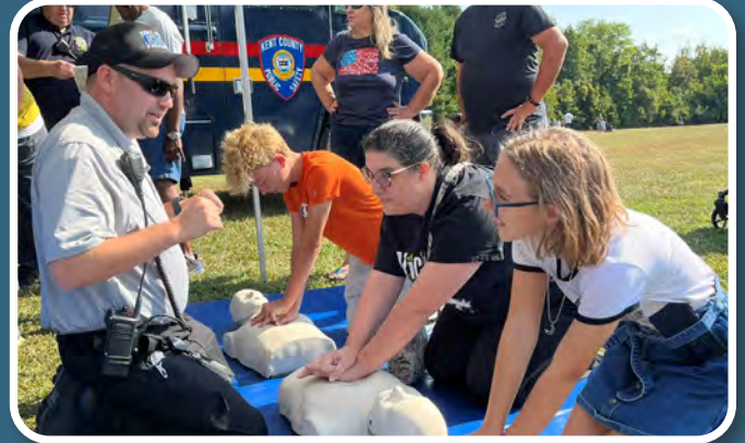
Kent County Paramedics conducted hands-on CPR training for all ages at FEP Day in Brecknock Park.