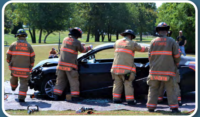
The Camden-Wyoming Fire Company demonstrated vehicle extrication procedures for FEP Day attendees.