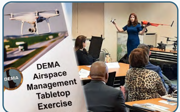
As part of the efforts of the Airspace Management Working Group, DEMA held a tabletop exercise in January 2024 at the St. Jones Reserve in Dover with state, county, and local governments, as well as the private sector and media outlets.