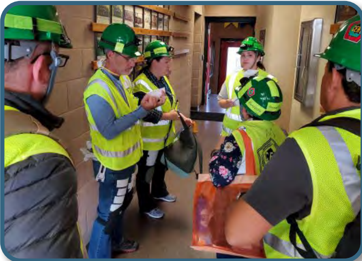
Above, CERT volunteers at a meeting in Sussex County. DEMA has taken steps to revitalize CERT in collaboration with its statewide partner agencies.