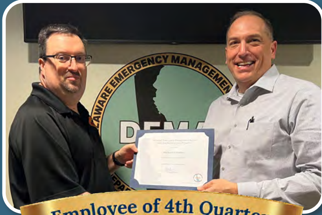
Employee of 4th Quarter