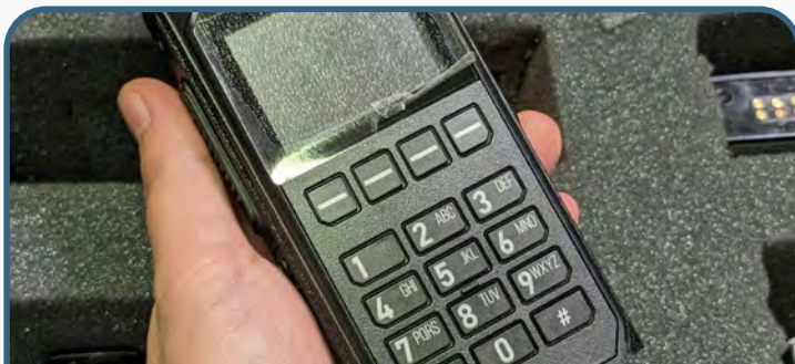
DEMA funded the purchase of new radios for the Delaware Forest Service's Wildland Fire Program.