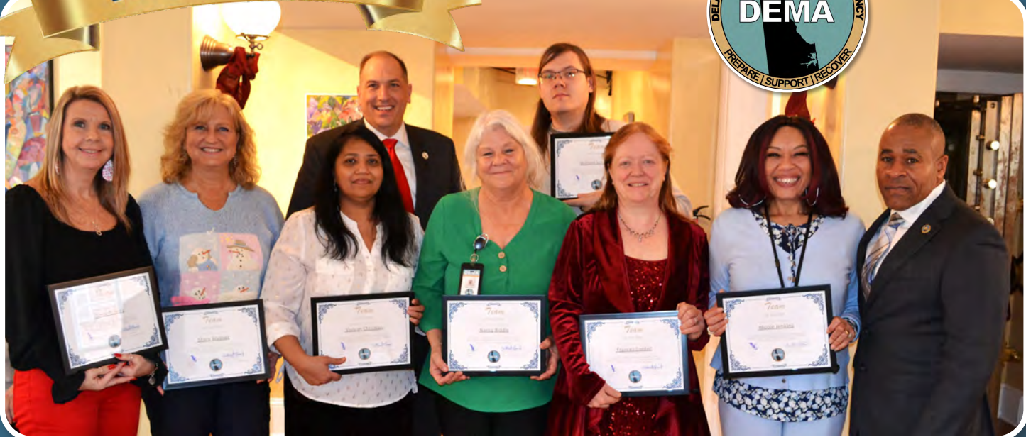
Team of the Year