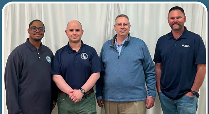
Delaware emergency management officials attended the NASTTPO Conference in April 2024 in Charlotte, NC.