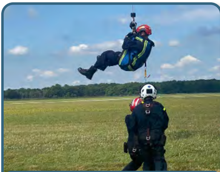
Delaware Air Response Team Training

Coordinated swift water rescue training for local fire companies and special ops teams. Twenty members of New Castle County's team were trained as NFPA 1670 Rescue Technicians. Kent County's team trained 19 Inland Rescue Swimmers, 10 Rescue Boat Operators, 26 Swift Water and 10 Floodwater Rescue Techs. Smyrna had five Ice Rescue Technicians, five Swift Water Rescue Techs, and 12 Rescue Boat Operators. In October, Delaware Task Force 1 deployed to North Carolina to conduct search and rescue and recovery efforts after Hurricane Helene.