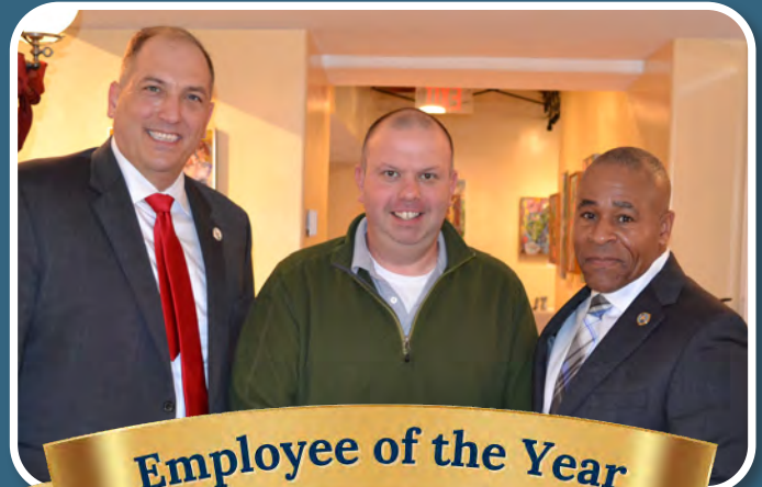
Employee of the Year